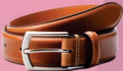
D Leather Belt